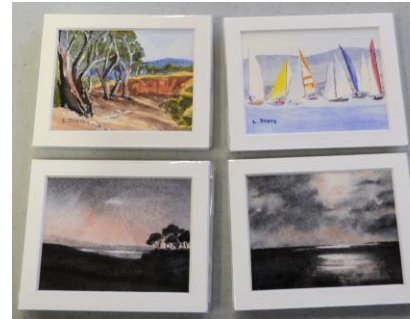
Miniature Watercolours by Les Shute