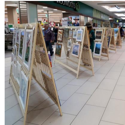
Screen Success Bayside Village, Glenelg