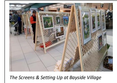
The Screens & Setting Up at Bayside Village