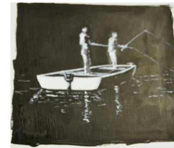
Work in progress for the future: Black and White study by Frank Cardone.

In New Zealand it is not possible to take a photo of a person with a wooden leg... Answer—you can't take a photo with a wooden leg.