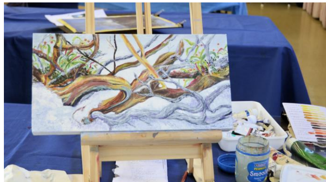
A work in progress for SALA?

We will be trying to organise article(s) to appear in our local newspaper.